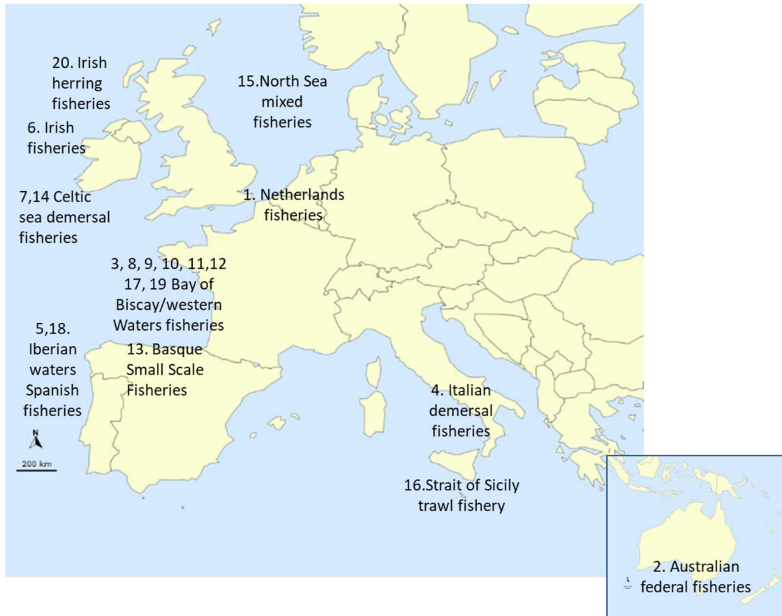
Fig. 1. Map of the case studies.

focus is on lessons learnt from the case studies analysis. Where SWOT findings concur with outcomes from the case study analysis regarding transdisciplinarity and implementation of EBFM, this is highlighted in the results and discussion sections.